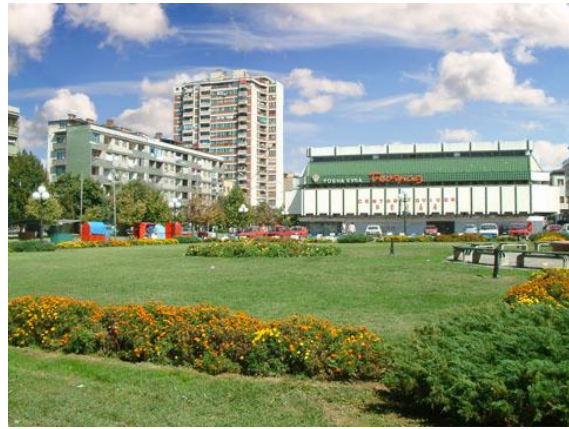
Panorama of the city of Leskovac